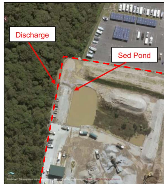
Figure 2: Monitoring locations

Image sourced from Metro Maps Photomaps, dated 17 December 2019